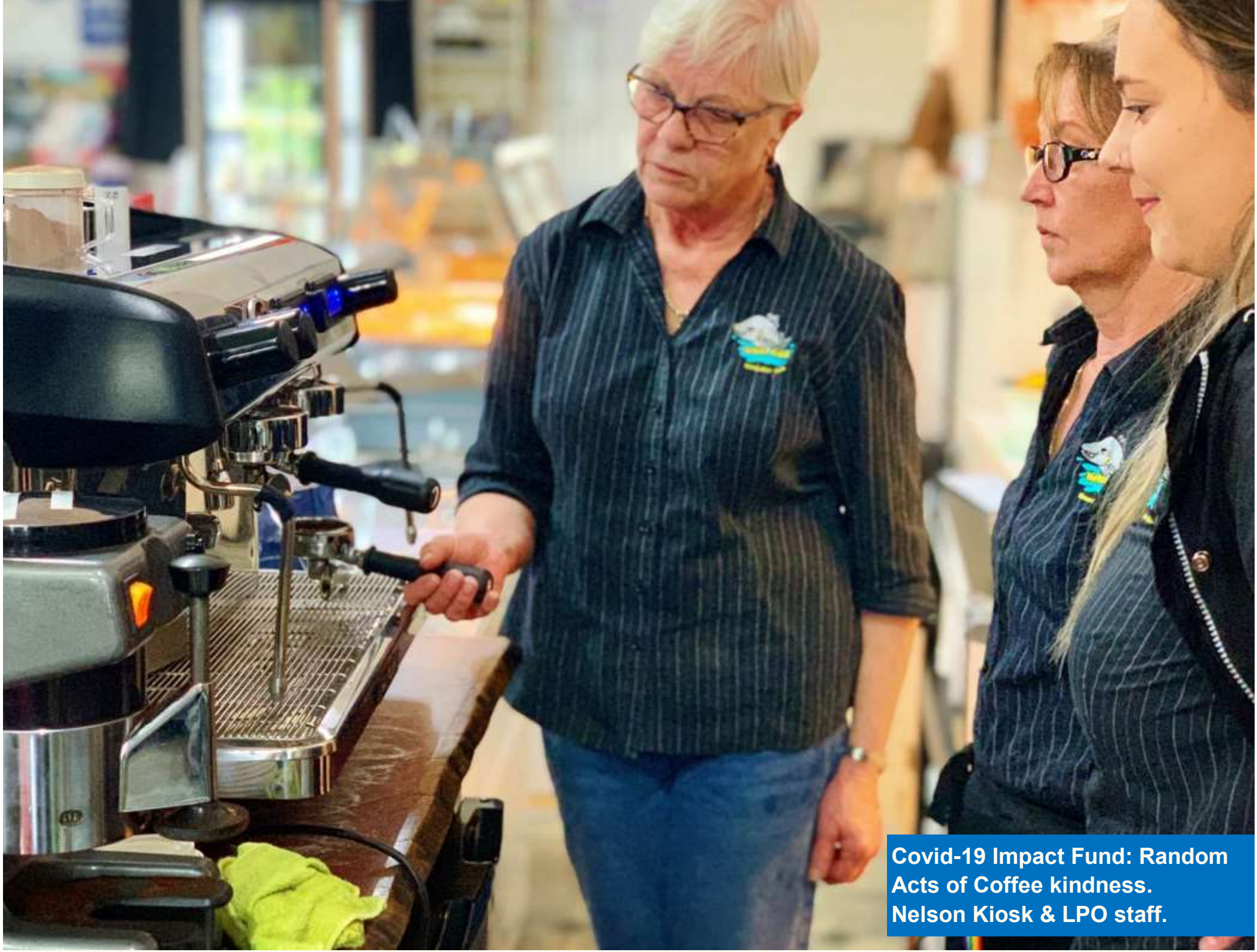
Covid-19 Impact Fund: Random Acts of Coffee kindness. Nelson Kiosk & LPO staff.